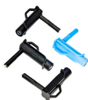
magnetic adapter (set of 4 pcs.)