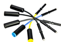
voltage adapter with M4/M6 thread (5 pcs.) WAADAM4M6