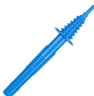
pin probe, blue 1 kV (banana socket) WASONBUOGB1