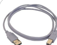
Data transmis- sion & analysis

Battery charging cable for 12 V car sockets WAPRZLAD12SAM