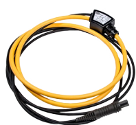
F-1A flexible clamp ( \varnothing 360 mm) 0...3 kA AC (10 kA p-p ) WACEGF1AOKR