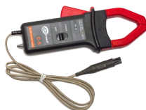
C-5A clamp 0...1 kA AC/DC (3.6 kA p-p ) WACEGC5AOKR