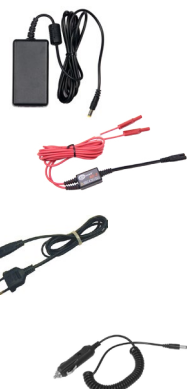
Power supply Z-7 power supply WAZASZ7

AZ-2 power adapter (IEC C7 plug / banana plugs) WAAZAAZ2