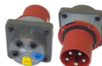
AGT-63P three-phase socket adapter 63 A WAADAAGT63P