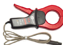
C-4A clamp 0...1 kA AC (3.6 kA p-p ) WACEGC4AOKR