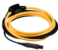
F-2A flexible clamp ( \varnothing 235 mm) 0...3 kA AC (10 kA p-p ) WACEGF2AOKR