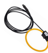
F-3A flexible clamp ( \varnothing 120 mm) 0...3 kA AC (10 kA p-p ) WACEGF3AOKR