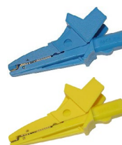
"crocodile" clip 1 kV 20 A blue/yellow-green