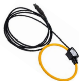
4x F-3A flexible clamp (Ø 120mm)