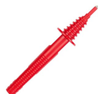
pin probe, red 1 kV (banana socket) WASONREOGB1