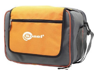
Storage & carrying