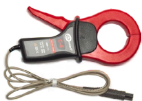
C-4A clamp 0...1 kA AC (3.6 kA p-p ) WACEGC4AOKR