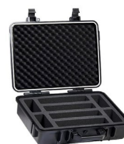
L2 carrying case for clamps WAWALL2