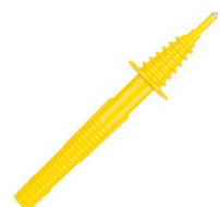
pin probe, yellow 1 kV (banana socket) WASONYEGB1