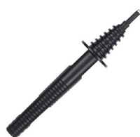
pin probe, black 1 kV (banana socket) WASONBLOGB1